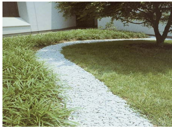
Our crushed products make an excellent matching border

All of North Carolina Granite Corporation's quarries and fabrication facilities met the highest environmental standards. None of our facilities discharge any waste materials—100% of what we harvest from the mother rock is converted into a finished product. We are also the leading granite supplier complying with the requirements of the "green" building movement and the sole US supplier of "rain screen" granite products for high rise structures.