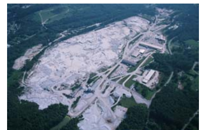
The world's largest open face granite quarry