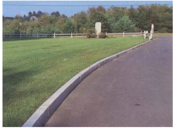
Define your lawn and drive edges.