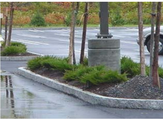
Granite curbing protects high traffic parking areas.