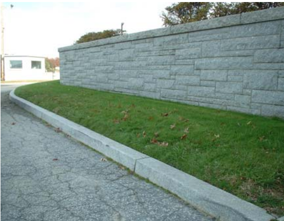
Matching ashlar retaining walls and curbing.