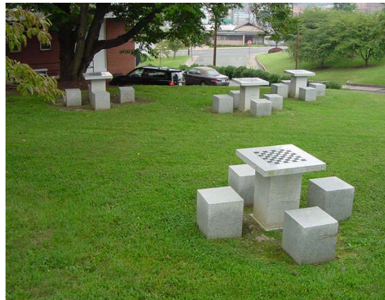
Decorative outdoor tables and seating.