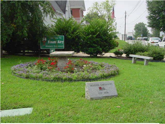
Birdbath, bench and commemorative sign

STREETSCAPE CURBING ASHLAR BLOCKS, PAVERS & LANDSCAPING ACCESSORIES